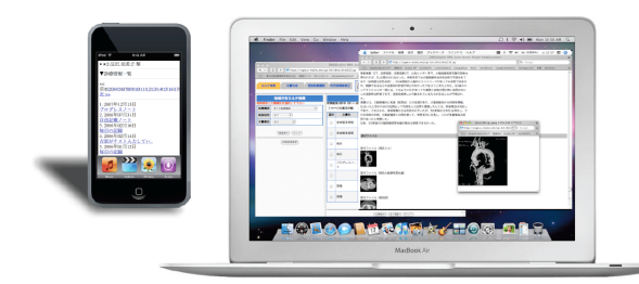
Figure 2 Browsing through medical charts by cell phone and personal computer